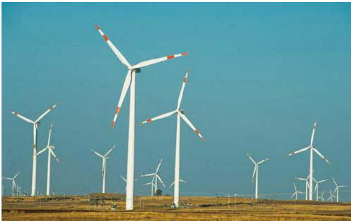
Fig. 2. Chhadvel wind turbines in Dhule, Maharashtra, India