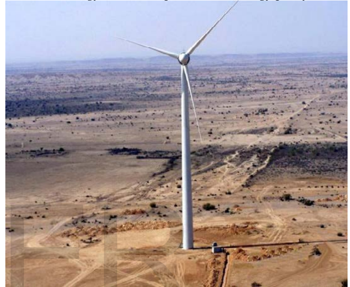
Fig. 3. Zorlu Wind Farm at Jhampir, Sindh, Pakistan

sources mapping and wind farm site locations, Pakistan has been facing some problems in developing its wind energy sector. These problems are mainly associated with the lack of government policies and budgetary constraints, political stability, failure to attract foreign and local investments in wind energy, lack of historical proven and bankable wind data, flood mitigation for potential sites for wind farms, lack of technological knowhow, skilled manpower, inadequate infrastructures development for the access to potential wind farm sites, lack of harmonisation province and federal policies on renewable energy, and inadequate overall energy policy.