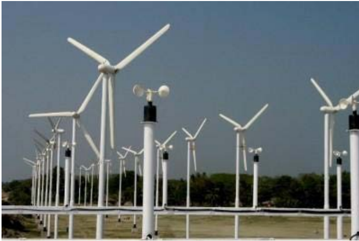
Fig. 1. Wind turbines at Kutubdia, Chittagong, Bangladesh

As mentioned in [3], the potential of wind energy in Bangladesh is not yet fully explored due to the lack of wind data and reliable wind history data. Bangladesh Centre for Advanced Studies (BCAS) in collaboration with Local Government and Engineering Department (LGED) and an international organization namely Energy Technology and Services Unit (ETSU) from UK with the funding from DFID have attempted to monitor wind conditions at seven coastal sites for a period of one year in 1996-97. They measured wind parameters at a height of 25m. However, no concrete findings on wind conditions from these seven sites were reported to public domain.